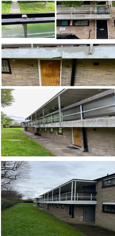
WALKWAYS NOW WITH BRILLIANT WHITE CEILINGS AND NEW LED LIGHT FITTINGS